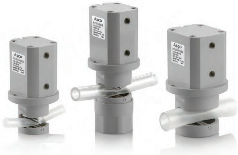
For single-use batch production, the ASCO Series 273 Pneumatic Pinch Valve features an innovative design that enables better tube retention and prevents breakage or damage to the soft tubing over repeated use — virtually eliminating any disturbance from valve motion to process media unlike other products on the market.