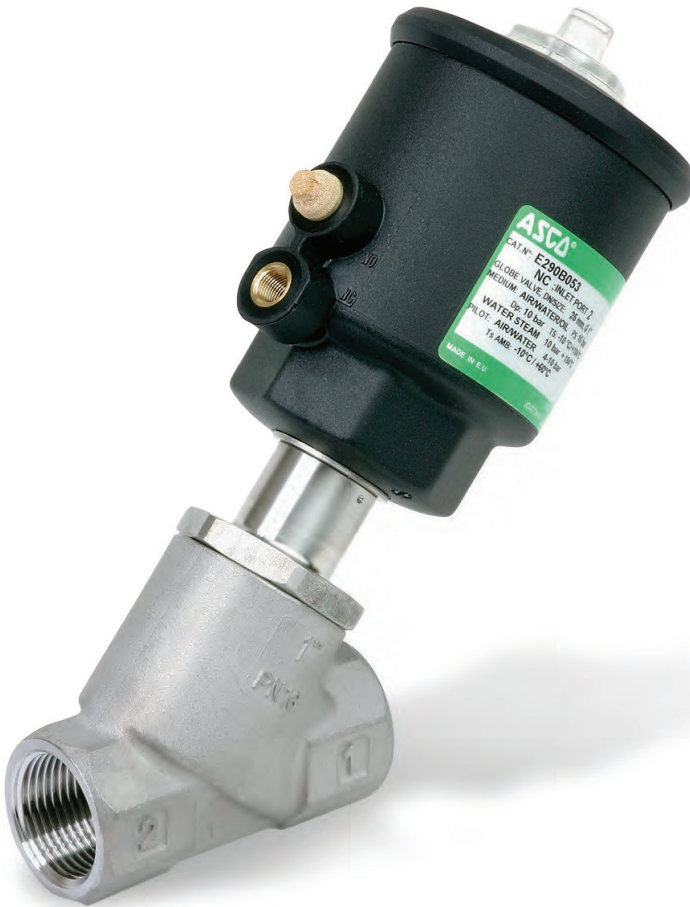
ASCO Series 290 Angle Body Valves handle various types of fluids in CIP and SIP applications.

media, features a high life cycle and provides a reliable pinching force without the need for an electrical connection. It should also resist corrosion due to tube breakage or washdown.